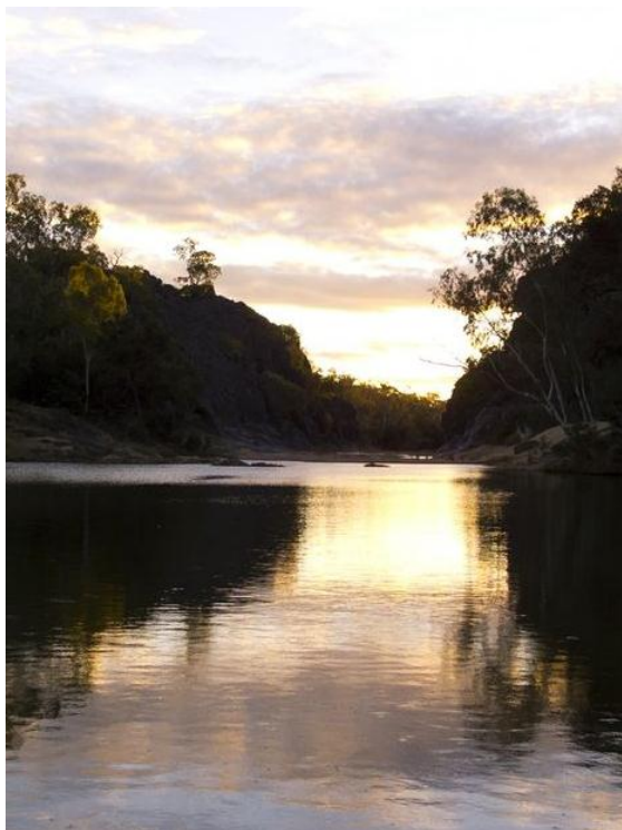
The gorge at sunset