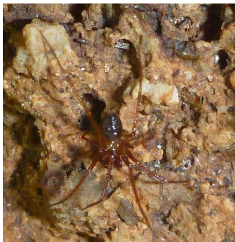
An interesting cave spider (~5mm)