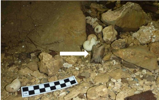
Tasmanian Devil Jaw in situ.

Deanne, Grant and I then went off to Swift Cave, this is actually Fig Fortress BR24. We went in via the usual track which is a bit gnarly. No bone deposits seen. We went out via the way that Tim Moulds and I found in 2011 which is far easier. This most likely is Fig Fortress Extension BR25