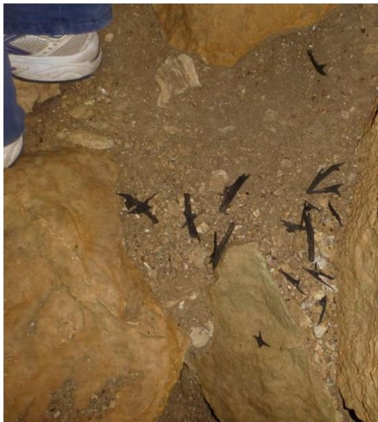
Fragments of bat wings from a cat killing and eating bats.