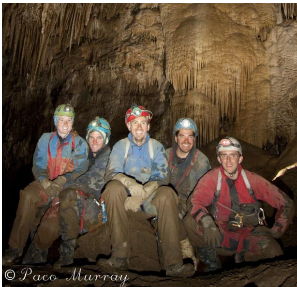
Expected conditions cold & wet, muddy – NZ (2012)

Caving conditions: All caves we will visit will have similar conditions – cold and wet. Temperature is around 6°C. You must have a waterproof trog suit and several layers of thermals underneath to survive.