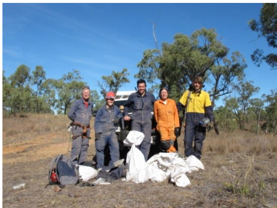
The paleontological team with breccia samples.

The towers are not as large or high as those at Chillagoe, but the style of cave development is similar: there are lots of ups and downs to negotiate the caves. There are also some vertical pitches, since the limestone is generally steeply dipping. The caves contain some great rift passages and plenty of ceiling pendants, remnant of the phreatic phase of the karst's development. Some extensive caves have frequent daylight holes like some of the caves at Bullita.