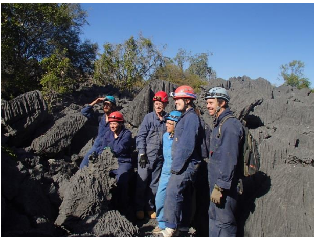
On top of the tower karst

I can’t not mention the night time meals. We could’ve run our own MKR out there with everybody trying to outdo each other. Some of the camp oven creations were fantastic. We ate very well and washed it all down with some great wine.