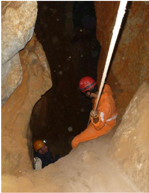
Descending into the main rift

ever. After patching up the slightly injured caver and resting his foot, we decided to cut the trip short and exit the cave through CH523.