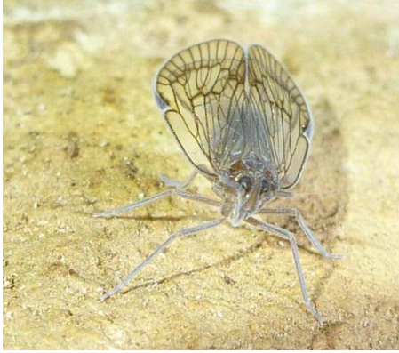
Chillagoe plant hopper

Exploration began with finding a navigable route up the southern face. Our group only just reached the base of the cliff line when Peter spotted a lower entrance only partially explored in September. This was thought to be the lower entrance to the new cave, but brief exploration revealed it did not connect. Evan explored further along the base of the outcrop and soon discovered another small entrance. This lead into a small rock pile with some well decorated spaces. Half an hour of exploration revealed the cave only contained about 50m of rock pile passage.