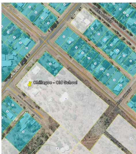
Queensland Globe over the clubhouse

An example is everything east of Chillagoe township, from Royal Arch Tower down to the Walkunder Towers and beyond. You can also view other spatial information maintained by the Department such as property boundaries, roads and the locality of other individual features.