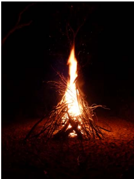
Bonfire by the creek

The group spent 4 days at Chillagoe, tackling a challenging trip through the Queenslander on their last day.