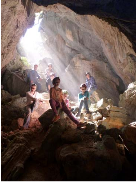
Back into the light – exiting CH502

The Club also hosted a troop of Venturer Scouts as part of a State Wide expedition based out of Cairns. Venturers from all over the State participated in activities such as backpacking, kayaking, bushwalking Hinchinbrook Island, and of course caving.