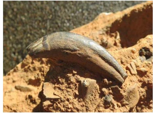
Tasmanian Tiger Incisor

In all it was an extremely successful trip with more than 160kg of breccia collected and sent to Brisbane. This will take more than six months to process in acid baths to free the embedded bones and teeth.