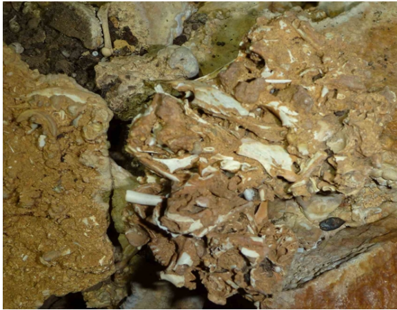
Breccia in Tripot Cave BR38

passage had a false floor about 5 metres in height that had many fossils in it. A duck under to the right led to a large chamber with daylight. The cave generally went on in a southerly direction and ended at a bat chamber. Another owl roost site called 'Dirt Slope' was located and further samples were taken.