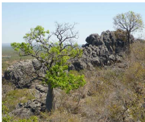
Piano (central) View south P.Bannink

With no vertical gear, exploration would have to wait for another time. We then walked west onto the next massive tower but found nothing significant. The top of the Tower did offer magnificent views over the whole area. Hot and bothered by 2.00pm we got out of the area before the heat really began to set in