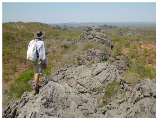
CH View over eastern section P.Bannink

It was about 10.00am when we got going and drove out to the locked gate near the Red Dome pit.