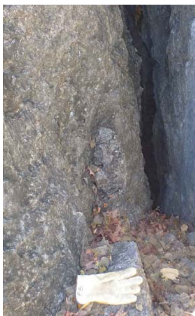
Piano Vertical rift (7m deep) P.Bannink

finally located a most promising vertical entrance and a deep narrow grike (7m) nearby.