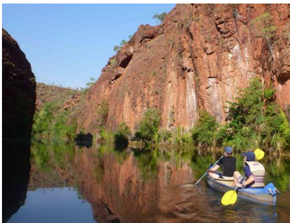
Lawn Hill Canoeing up the gorge