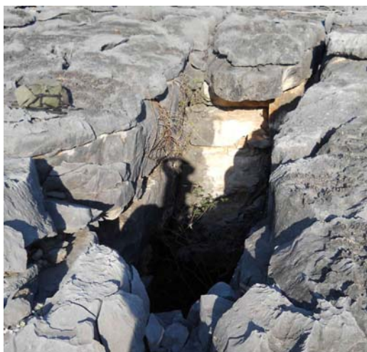
Colless Creek Vertical Entrance P.Bannink

The first objective was too relocated and GPS the existing entrances but as I proceeded walking on the exposed outcrop, navigation became very difficult. I encountered quite a few vertical entrances which dropped into rifts about 7m below the surface. I decided to instead walk around the perimeter and record any entrances which I located.