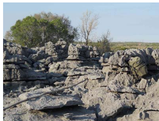
Colless Creek Karst Landscape P.Bannink

The walking was very easy and trusting my field map I reached the outcrop by about 7.15am. The area is very like karst at Bullita in the Northern Territory. A very large flat lying limestone outcrop (karrenfield), with increased levels of karst exposure and development as one trend towards Colless Creek. The area is quite large 1.2km x 700m so I was not quite sure where to start..