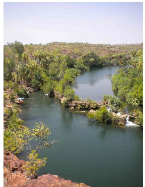
Lawn Hill Indarri Falls