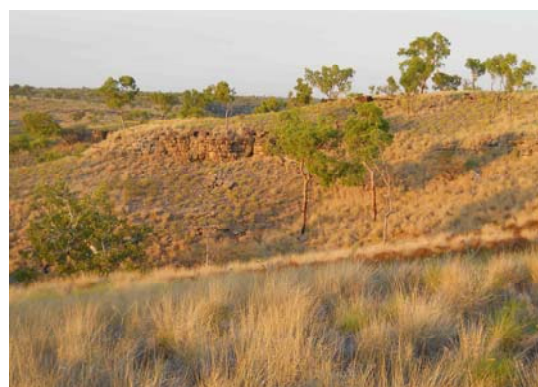
CK Surrounding country side P.Bannink

I started off at 5.00am and got half way there before a brilliant dawn signalled the start of the coming heat wave. Crossing the river above the upper gorge lookout, the first outcrops of Thornton Limestone were encountered. A short climb up the moderately steep side of the gorge, allowed access to a ridge-line which lead to the Colless Creek Grikefield, after about a 1 km of walking.