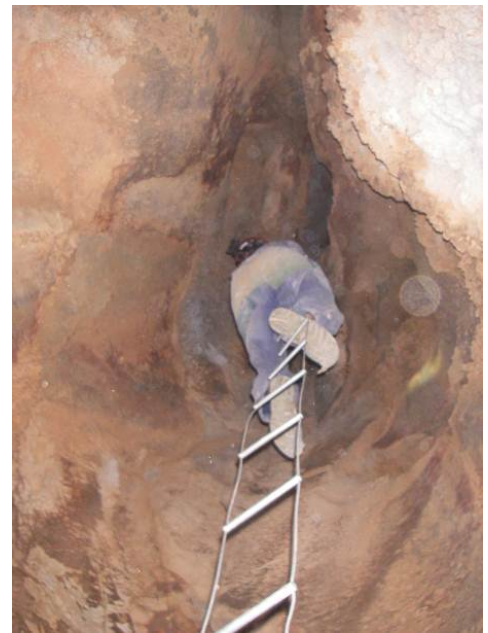
Laddering into CH 543 (B Dane)

This lands you at the bottom of the entrance shaft and from there it is another 4 metres via a ladder to the bottom of the cave itself.