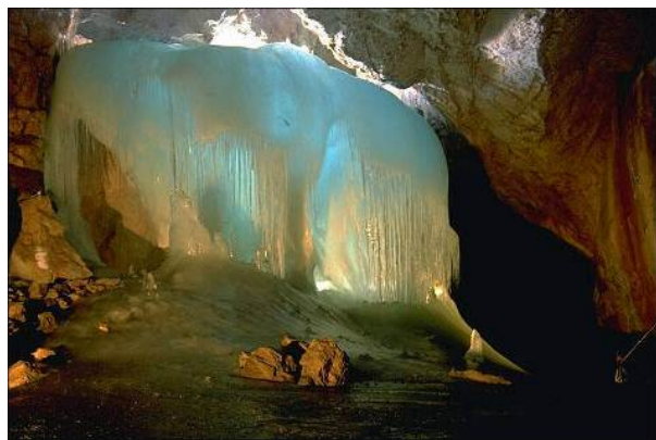
Ice formation

Recently I visited the world's largest ice cave situated near the town of Werfen in Austria. The cave's name literally means 'Giant Ice World' and it is truly justified. As you walk through the cave there are massive formations of solid, blue and translucent ice all around you. These formations are always changing dependent on the wind, snow and rain.