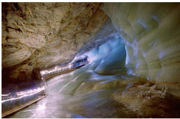
Climbing stairs in the cave

Unfortunately no photos are allowed inside the cave, but the photo below is from a postcard sold there.