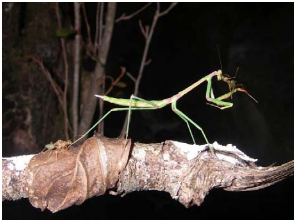
Insect battle – green ants vs praying mantis (W Weiss)

On a recent trip into Castle Cave the following photo was snapped:-