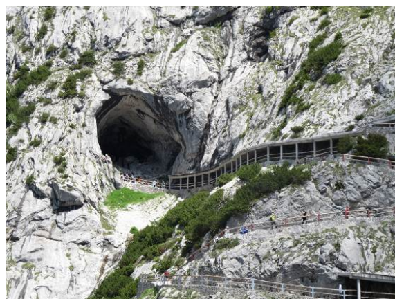
Cave entrance and walkway leading up to it (W. Weiss).

The entrance is actually near the top of the Hockkogel mountain in the Tennengebirge (Austrian Alps) and is at an elevation of 1641m. It can only be reached by walking from the tourist information centre for about 20 minutes to a cable car. The cable car whisks you up a section of the mountain that used to be another 90 minute slog and deposits you at the start of a walkway (another 20 minutes) leading to the cave entrance.