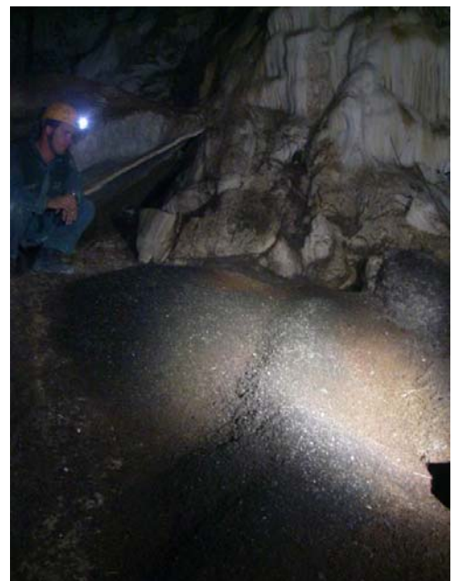
Swiftlet guano pile in CH 543

The cave develops into one large chamber of about 5 x 10 metres with a rubble slope at one end. A couple of smaller chambers (2 x 4) make up the cave's entirety. There are nice formations throughout the cave.