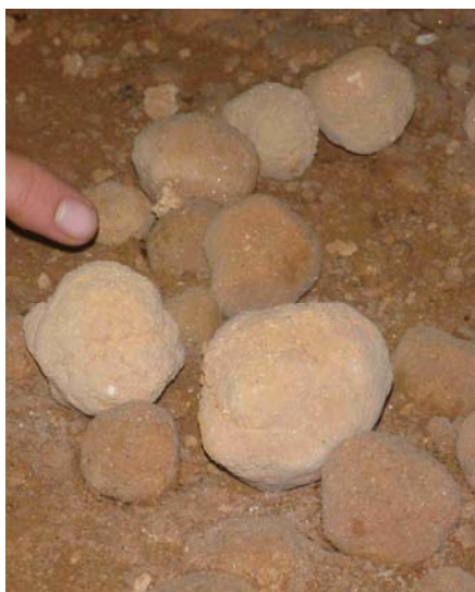
CH351 Giants Oolights P.Bannink

We were also treated to a fantastic light display at 10:15am as a light beam lit up the main chamber to reveal fantastic formation in the roof arches.