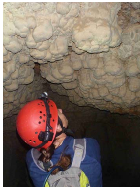
Kimberlee examining roof formation P.Bannink

This cave was completely flooded in March 2011 and it's taken some time for the cave to dry out again. It was a worthwhile visit as the receding waters have left the place literally sparkling.