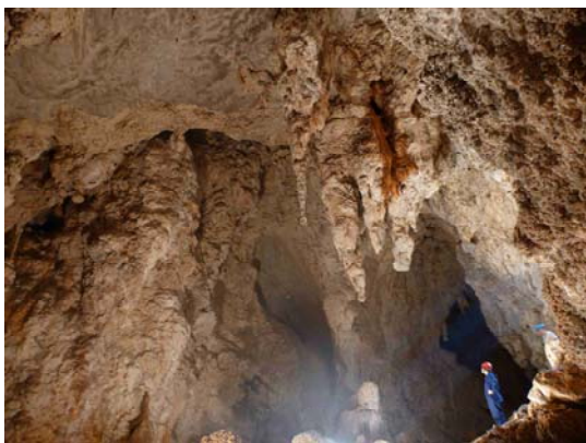
CH351 Main Chamber P.Bannink

Great care was taken moving through the cave as the dusty muddy floor has become hard and calcite covered. Large oolights were scattered over the floor.