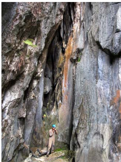
Another rift entrance to CH539

The cave was later surveyed to nearly 400m with more to go. It has two tagged entrances CH539 and CH540. The cave has been called Blindsight, for the fact that a massive walk in entrance to such a large cave (400m) had not been discovered in 40 years of cavers caving in and around the Tower.