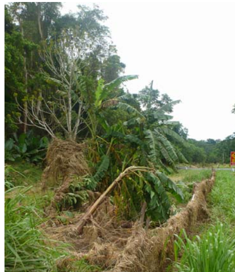
Flood damage to fence line