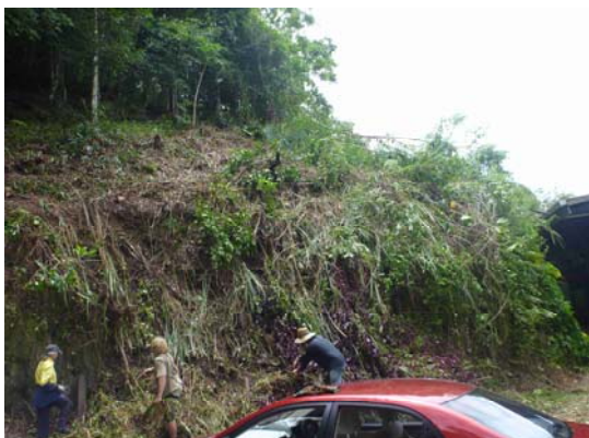
Clearing vegetation at Alan's house

On Saturday the 10 th March quite a few members gathered at Alan's place to help chop out rainforest encroaching on Alan's house. It was hot wet work but after mountains of vegetation were cut and moved (more than 12 truck loads) the group succeeded on clearing a 20 metres boundary at the back. The slope was so steep most workers were clinging onto severed tree trunks to avoid sliding (falling) 6m down the cutting.